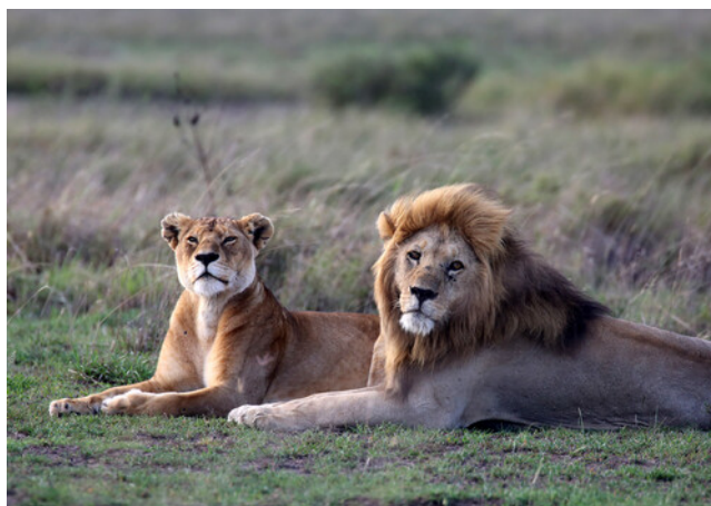
Serengeti National Park