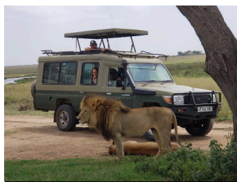
Signature 6 seater 4x4