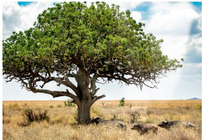
Serengeti National Park