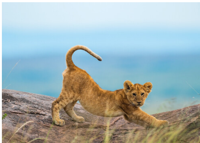
Serengeti National Park