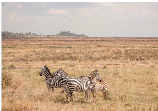
Central Serengeti National Park