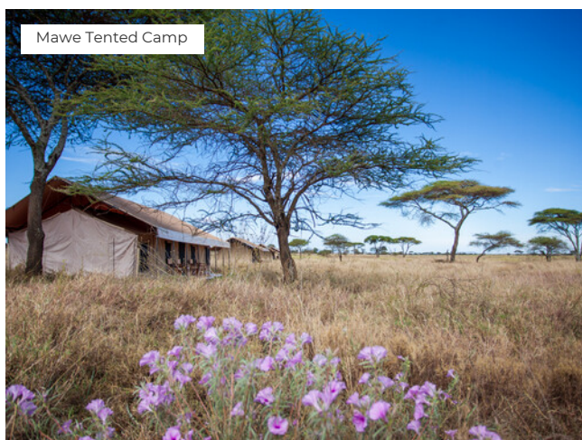
Mawe Tented Camp