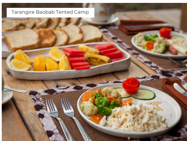
Tarangire Baobab Tented Camp

You'll really enjoy the location of Tarangire Baobab Tented Camp, which is inside Tarangire National Park in an area with lots of baobab trees. Elephants often wander into camp. Best of all, you'll be sleeping in canvas safari tents where you can lie in bed and listen to the animals at night. The tents have their own bathrooms and there's a dining tent.