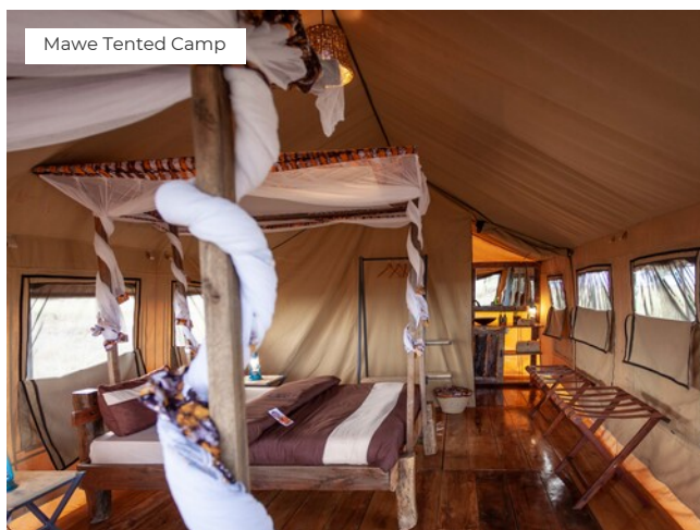
Mawe Tented Camp

You'll feel a part of nature at Mawe Tented Camp. In your safari tent, you're surrounded by the famous savannah grasslands of the Serengeti, and only canvas separates you from some of the biggest wildlife populations on the planet. The camp is close to Seronera in the center of the park, and facilities include a bar, restaurant and campfire area.