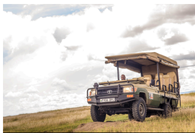
Open game vehicle